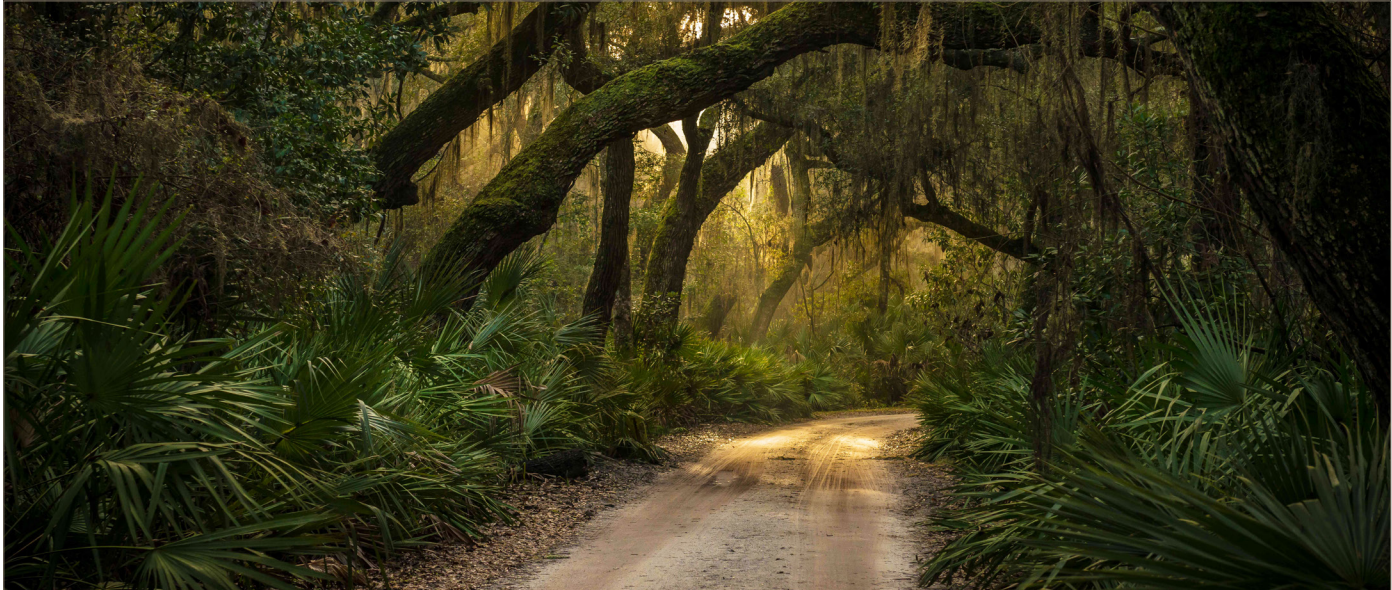
Cumberland Island National Seashore